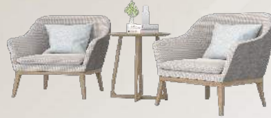
Occasional Chairs Occasional Table