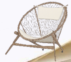
Lounge Chair 2