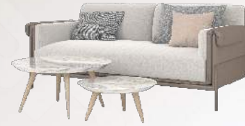
Sofa Tea Table