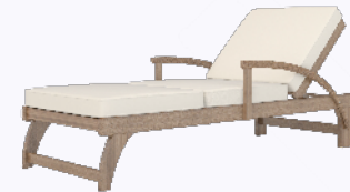
Lounge Chair 1