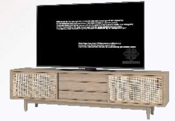
TV 42' 120cm TV Stand