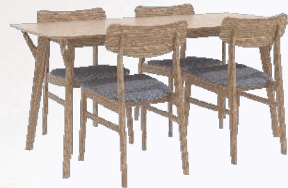
140cm Dining Table Dinning chairs