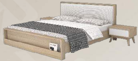
50cm Nightstand 180cm, 150cm Bed/Mattress